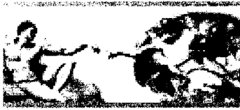
A Theology of the Body